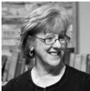
Hon. Mary Rudolph Black , Probate and Family Court, Commonwealth of Massachusetts